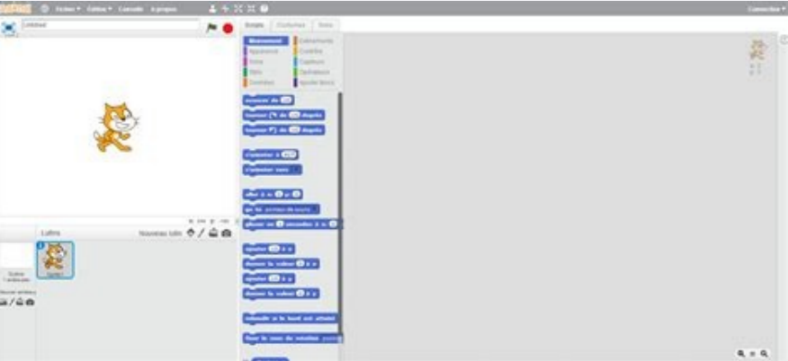
Scratch live 2.4 2 download for mac free. Does scratch work on mac. Scratch 2 free download for mac. Is scratch 2 free.